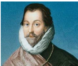
Sir Francis Drake Circumnavigated the globe between 1577 and 1580.