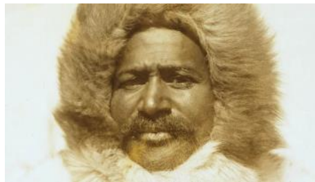
Matthew Henson The first person to reach the North Pole in 1909.