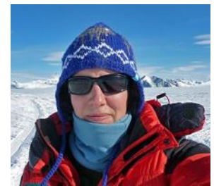
Felicity Aston The first woman to ski alone across Antarctica in 2012.