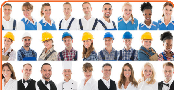
We can decide what job we want to do and being a boy or girl should not affect what we choose.