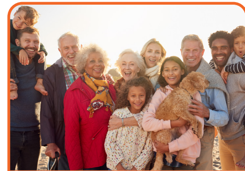
Other people's families might be different to yours, but that is OK.

We can sometimes see how people are feeling by their body language, such as smiling.